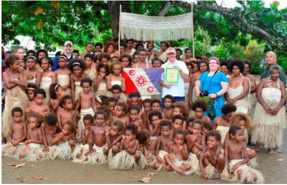
Notari of Maewo with Explorers Club team and Flag

Then Cyclone Pam hit, in March 2015. The festival was postponed to August 2016, and morphed into more of an all-island event focused on women's arts and traditional practices. But the female chiefs of Maewo would still be a key part of the festival.