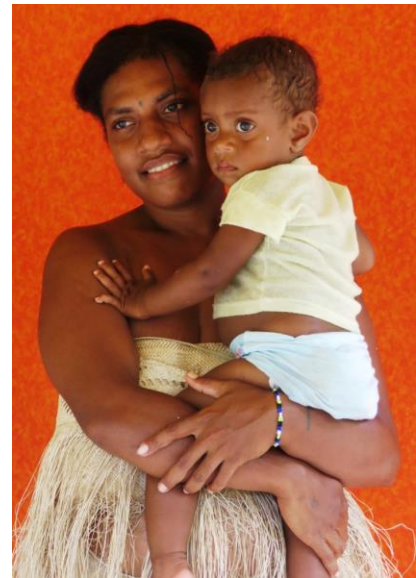
A Notari of Maewo and her child